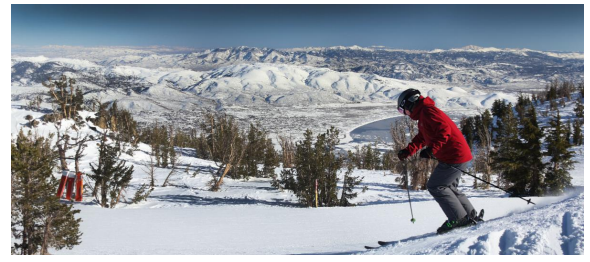
NASJANS attack the Slide Mountain side of Mt. Rose Ski Resort.--