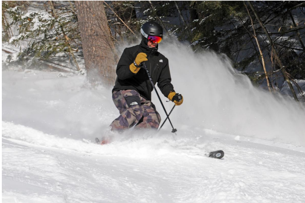
King Pine on Jan. 30 after receiving a half-foot of snow.