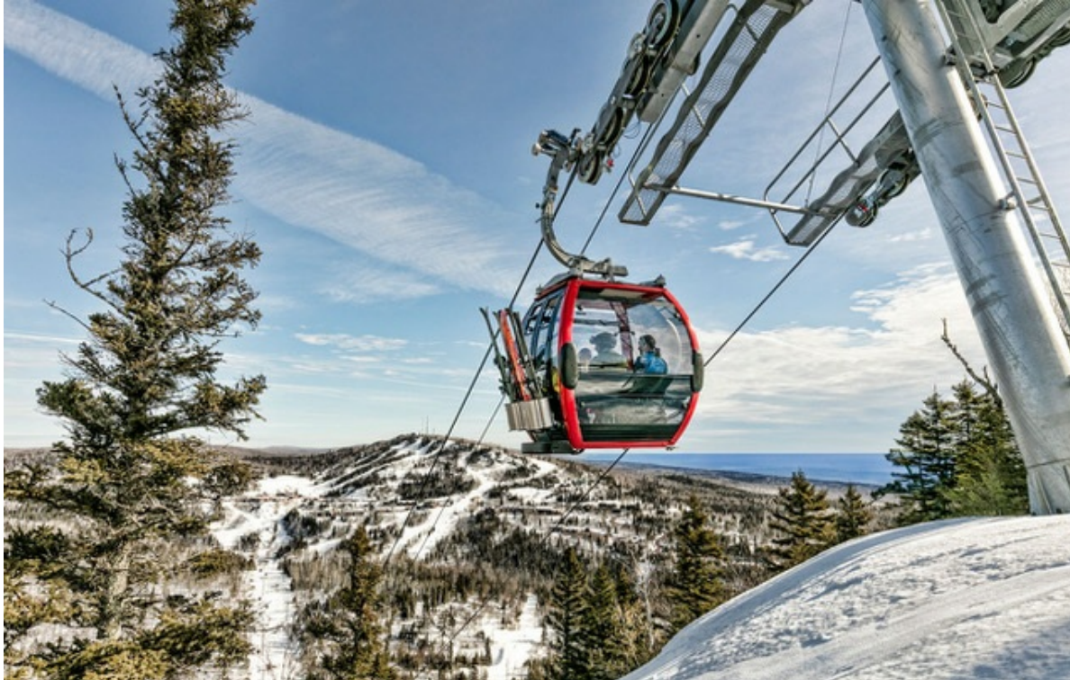
The Lutsen gondola