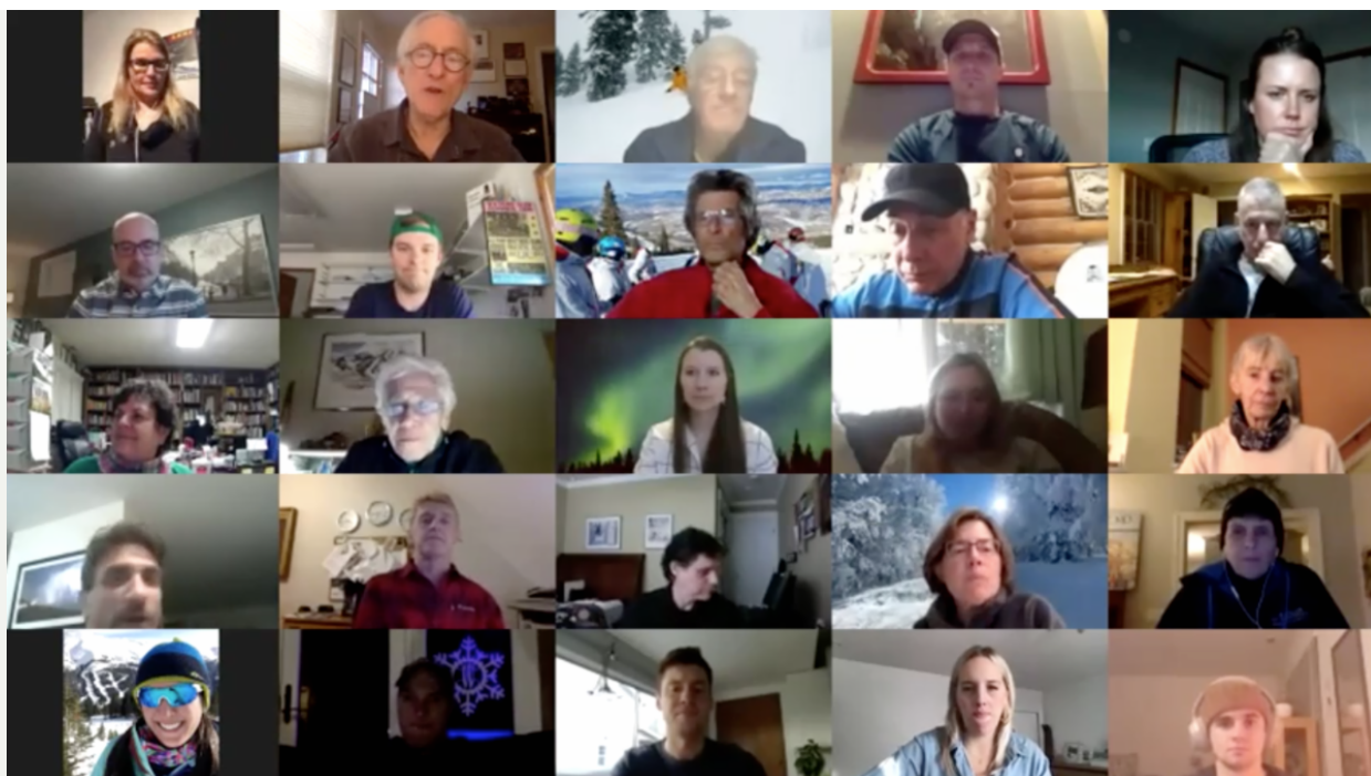
Scene from NASJA's Pitching the Media Professional Development session on Feb. 23, 2021