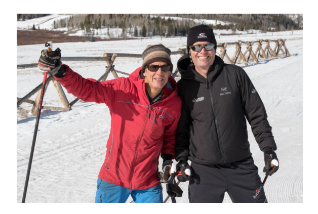
Bogus Basin hosts CCSAA next month