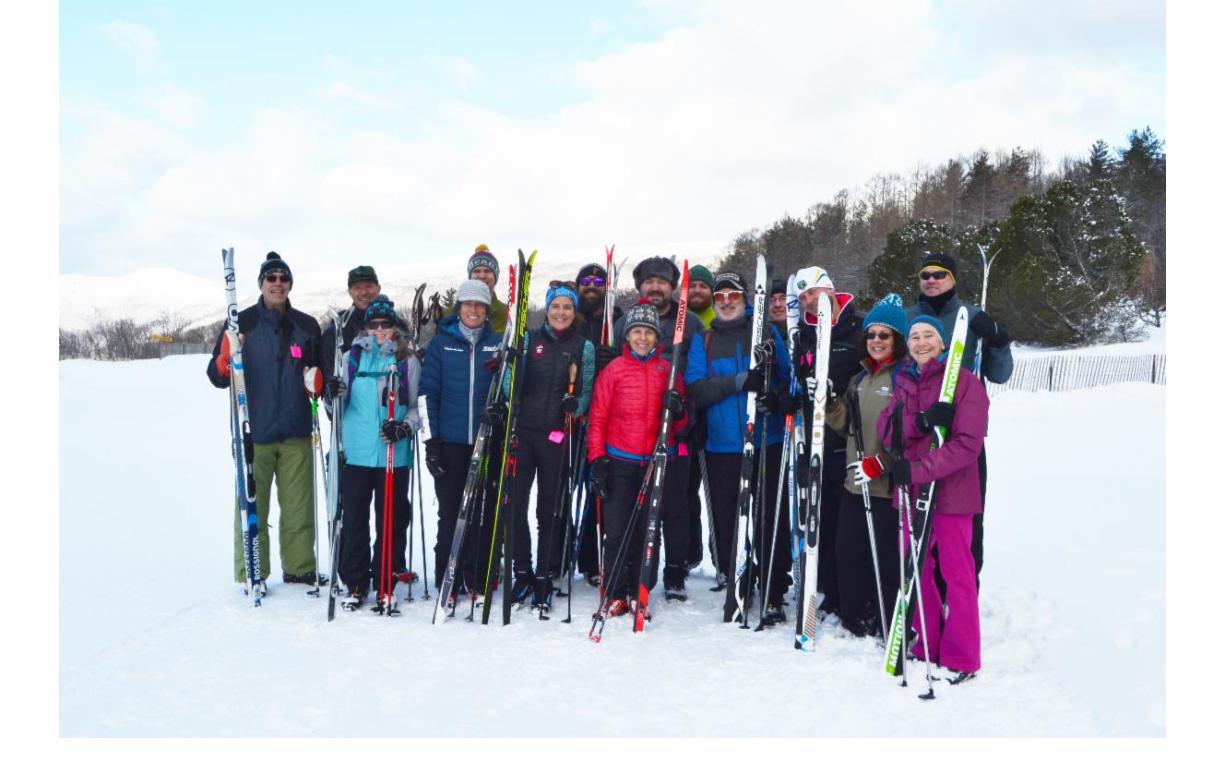
Ski Vermont Day.