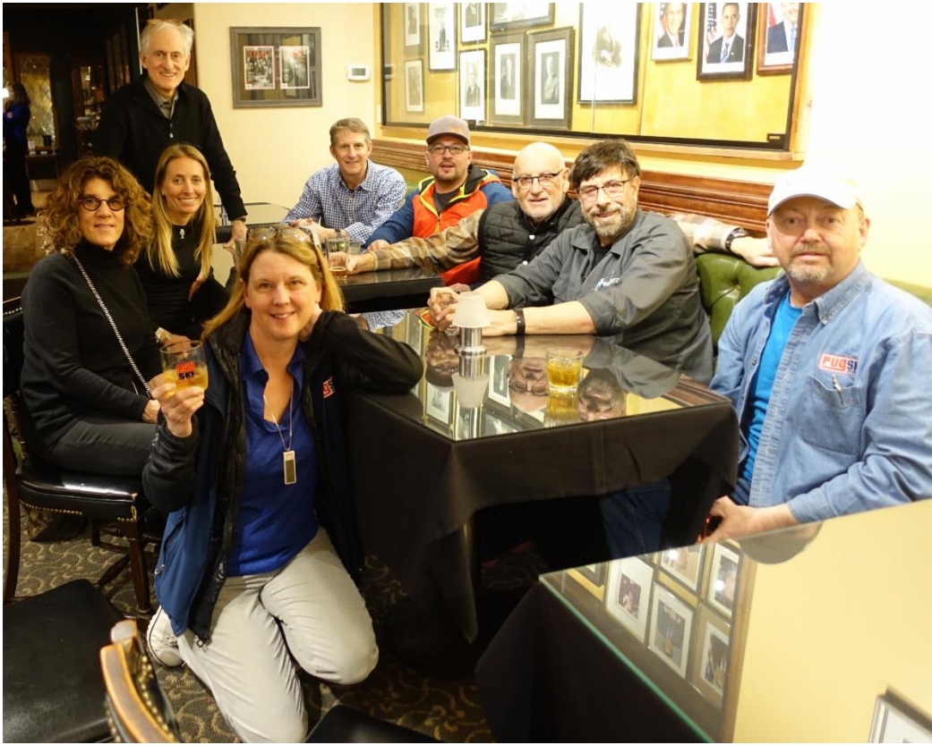
NASJA's Meet & Greet on the final day of the Outdoor Retailer + Snow Show in Denver, Jan. 31